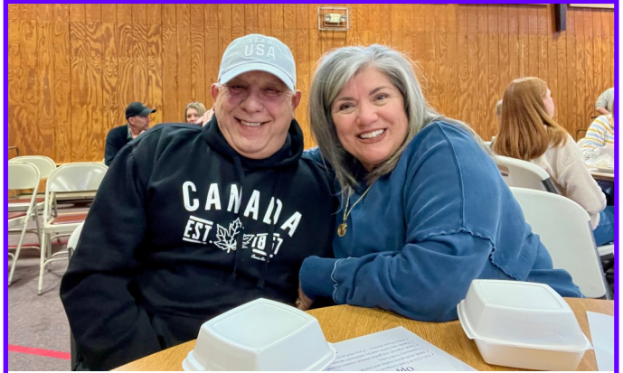
This couple celebrated their 50th wedding anniversary at Unionville's Fish Fry!