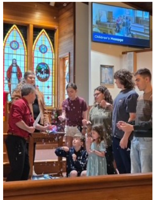
Object lesson about the Holy Spirit during Children's Sermon on Pentecost Sunday.

We don't work for the Holy Spirit; we wait on the Holy Spirit!